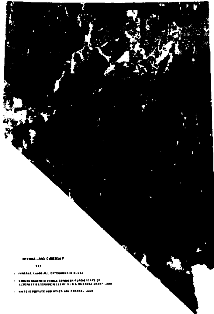
Fig-1 LAND MASS IN NEVADA CLAIMED BY FEDERAL GOVERNMENT

Sec-10 made it clear that Congress agreed to dispose of the public lands when it was agreed by the parties that; the sales of all public lands lying within said state, ... shall be sold by the United States subsequent to the admission of said state into the Union. The above map (Fig-1) clearly shows that Congress did not keep that promise and then unilaterally withdrew all disposals in 1976 with the enactment of the Federal Land Policy and Management Act , or FLPMA (Pub.L. 94-579), which is well known that was the Act that fueled the Sagebrush